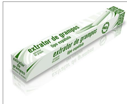
Package for 1 unit