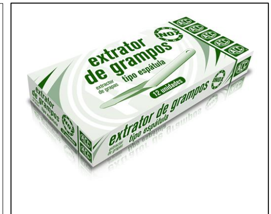
Packing for 12 units